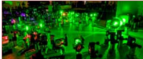
Part of the Vulcan 10 PW front end at RAL Courtesy STFC RAL

Ian Musgrave STFC Rutherford Appleton Laboratory