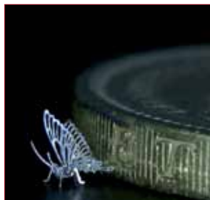
Micronanics manufactured part